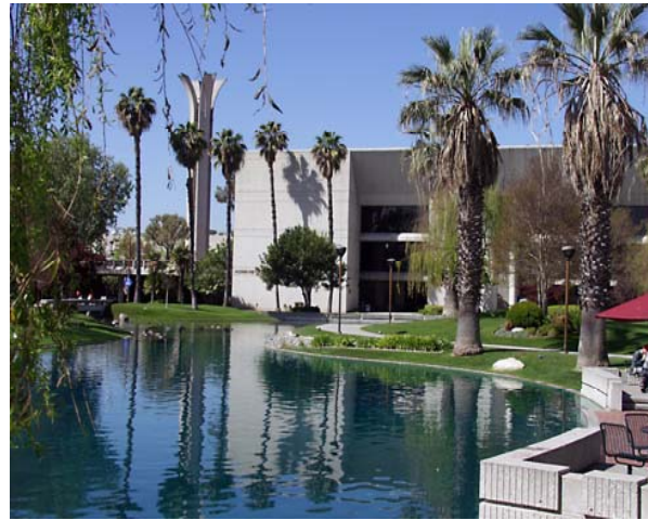
North Orange County Community College District